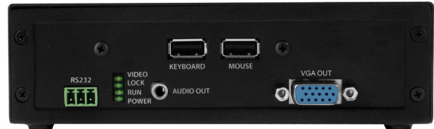
FVX-3000-PRO Receiver Front Panel