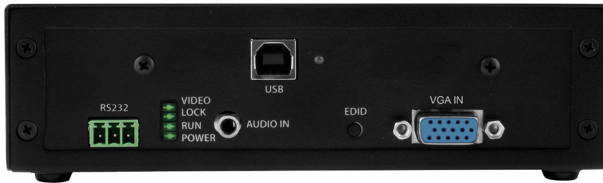
FVX-3000-PRO Transmitter Front Panel