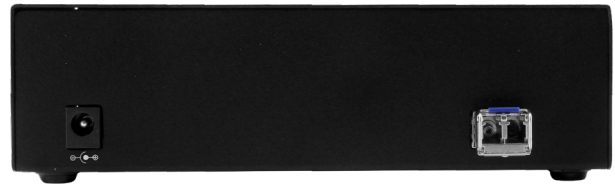
FVX-3000-PRO Receiver Back Panel